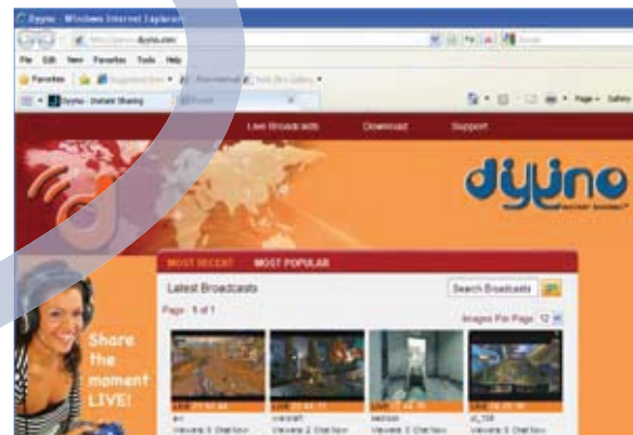
LIVE GAME GUIDE